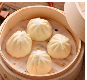
Filled bao buns