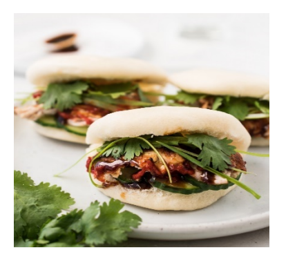
Hirita bao buns